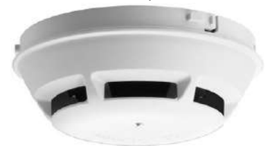
Model OP921 Photoelectric Smoke Detector

The smoke chamber is designed to manage light dissipation and extraneous reflections from dust particles or other non-smoke, airborne contaminants in such a way as to maintain stable, consistent detector operation. When smoke enters the detector chamber, light emitted from the IRLED is scattered by the smoke particles and is received by the photodiode (see: images on page 2).