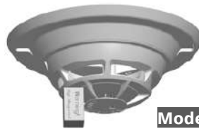
Model OH121 (with TM121 Test Magnet)

An indication of supervision status is provided by Siemens Fire's unique (3) three-color light-emitting diode (LED) provided locally on the detector — and optionally with the various remote LED indicators.