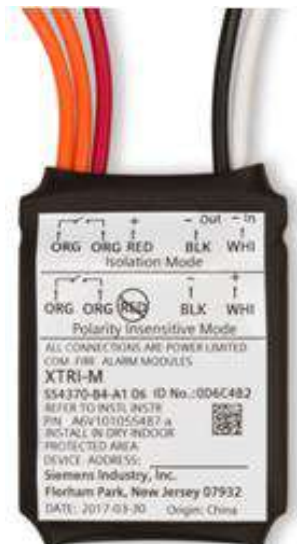
Model XTRI-M Mini Interface Module

Advanced troubleshooting is provided by the FACP that is interfacing with Model XTRI-M. That panel can even identify when a Model XTRI-M is configured as an isolator, but that same Mini Module is wired incorrectly in a polarity-insensitive mode.