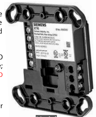
Model XTRI-D | XTRI-R | XTRI-S Intelligent Device Interface Module

This single-input interface module can only monitor and report the status of a N.O. or N.C. contact.