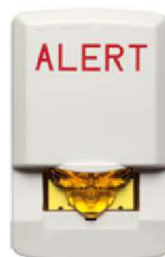
Model SLSWW-ALA Strobe