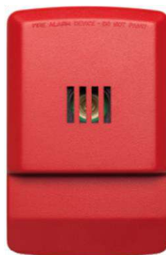
Model SLHR-N Horn

The `SL'-series is apt for indoor wall-mount applications. The Model `SLH'-series horn appliances work in either 12V or 24VDC, whereas the Series `SLSW' and `SLHSW' strobe and horn-strobe devices are specifically for 24V operation.