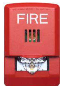
Model SLHSWR-F Horn-Strobe