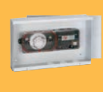
Weather-proof enclosure NEMA 3R WP-2000 Order no.: 500-649714