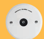
Class X Intelligent Lamp, Ceiling Mount, Tri-Color LED with Built-In Isolator ILED-XC Order no.: S54370-B6-A1