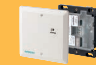
Input/output module FDCIO422 – 4 inputs, 4 outputs – Class A and B wiring Order no.: S54322-F4-A1