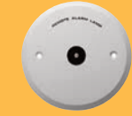
Ceiling mount remote lamp RL-HC Order no.: 500-033230