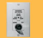
Remote test lamp FDB2492-RTL Order no.: S54319-S27-A1