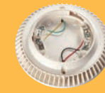
Audible base ABHW-4S (520Hz) Order no.: S54320-F14-A1