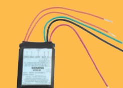
Mini single input interface module HTRI-M Order no.: 500-034000