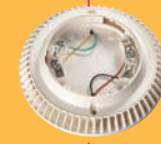
Audible base ABHW-4B Order no.: S54320-F13-A1