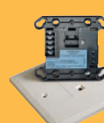
Single input interface module with relay HTRI-R Order no.: 500-033300