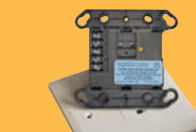
Line isolator HLIM Order no.: 500-033170