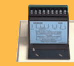
Conventional zone module HZM Order no.: 500-034850