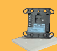
Single input interface module HTRI-S Order no.: 500-033370

Note: Contact Siemens Tech support for compatible panels.