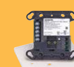
Class X Single Input Monitor Module with Built-In Isolator XTRI-S Order no.: S54370-B3-A1