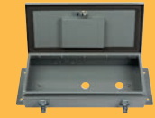
Optional water-tight enclosure NEMA 4X FDBZ-WT Order no.: S54319-B26-A1