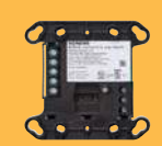
Class X Dual Input Monitor Module with Built-In Isolator XTRI-D Order no.: S54370-B2-A1