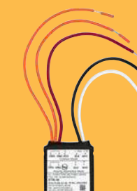
Class X Mini Input Monitor Module with Built-In Isolator XTRI-M Order no.: S54370-B4-A1