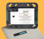
Control point HCP Order no.: 500-034860