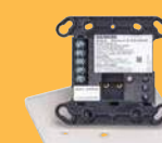
Class X Single Input Monitor Module with Relay & Built-In Isolator XTRI-R Order no.: S54370-B1-A1