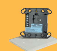
Dual input interface module HTRI-D Order no.: 500-033360