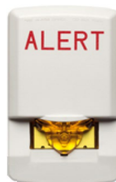
Model SLSWW-ALA Strobe