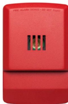
Model SLHR-N Horn

The `SL'-series is apt for indoor wall-mount applications. The Model `SLH'-series horn appliances work in either 12V or 24VDC, whereas the Series `SLSW' and `SLHSW' strobe and horn-strobe devices are specifically for 24V operation.