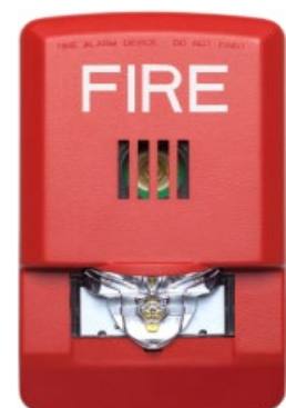
Model SLHSWR-F Horn-Strobe