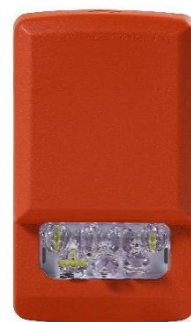
Model SL2SWR-N Strobe