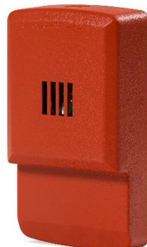
Model SL2HWR-N Horn

The Model `SL2HW'-series horn appliances work in either 12V or 24VDC, whereas the Series `SL2SW' and `SL2HSW' strobe and horn-strobe devices are specifically designed for 24V operation. The `SL2'-series is apt for indoor, wall-mount applications.