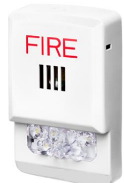
Model SL2HSWW-F Horn-Strobe